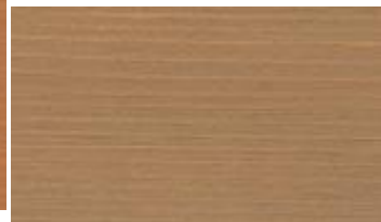
Taupe – LO Taupe MWDSAT28 – DR Taupe DP-326 – HD Spice Chest SW 3513 – SW