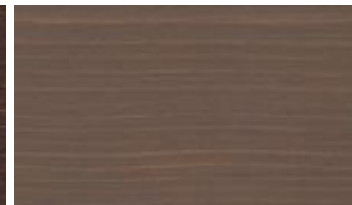
Spanish Moss – LO Khaki MWDST7 – DR Pewter DP-518 – HD Hill Country SW 3552 – SW