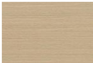
Dune Gray – LO Monterey Grey MWDST18 – DR Sunset Grey DP-538 - HD Driftwood SW 3027 – SW