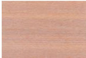
Clear Manufacturer by all